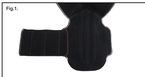
Brace set up for left side