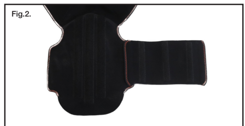
Brace set up for right side